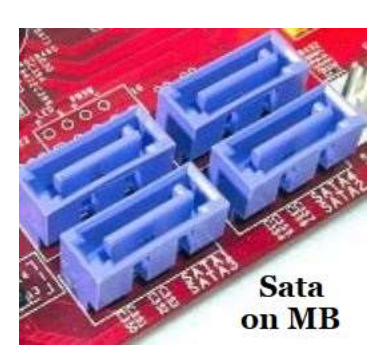
General rule: Doesn't matter which one you plug the cable in. (Some motherboards are different. Consult the motherboard's manual)